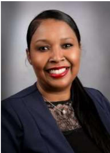
Minority Caucus Chair - Democrat District 13 - St. Louis County First elected to the Senate: 2020 View District Map (PDF)

Senator Angela Walton Mosley, a dedicated Democrat, has served the citizens of the 13th Senatorial District in the Missouri Senate since January 6, 2021. Notably, she and her husband, state representative Jermond (Jay) Mosley, make history as the first married couple to concurrently serve in the Missouri Legislature.